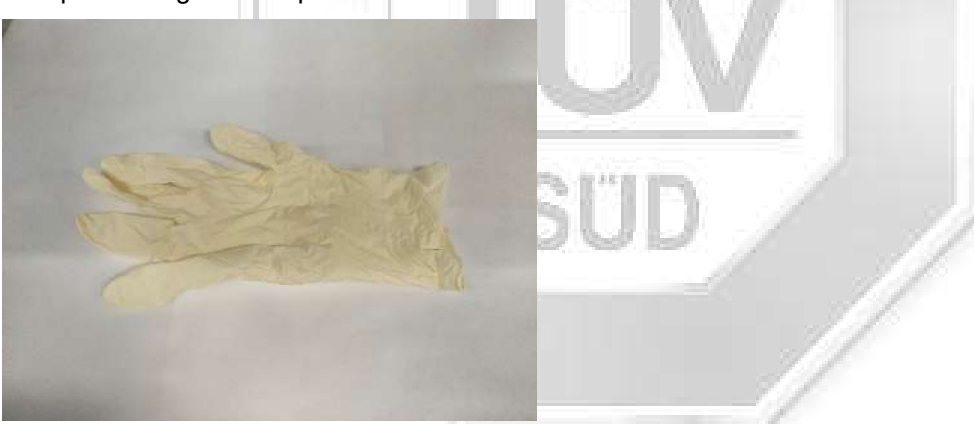
Picture 1: "Mumu Latex Powderfree Examination Gloves" Sample as received

One packet of glove sample labelled as follows was received.